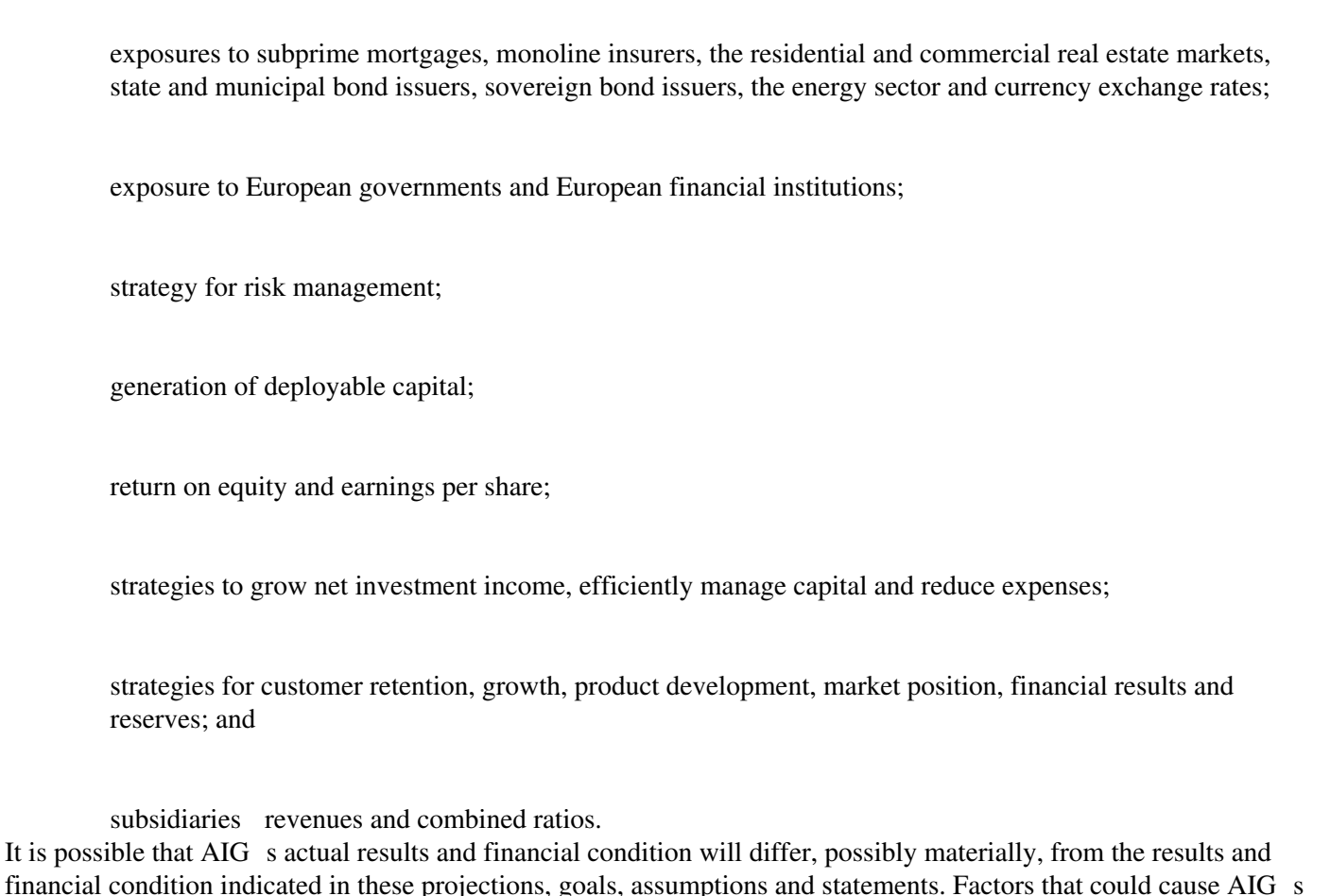
Table of Contents 49

This prospectus and other publicly available documents, including the documents incorporated herein by reference, may include, and officers and representatives of AIG may from time to time make, projections, goals, assumptions and statements that may constitute forward-looking statements within the meaning of the Private Securities Litigation Reform Act of 1995. These projections, goals, assumptions and statements are not historical facts but instead represent only AIG s belief regarding future events, many of which, by their nature, are inherently uncertain and outside AIG s control. These projections, goals, assumptions and statements include statements preceded by, followed by or including words such as believe, anticipate, expect, intend, plan, view, target or estimate. These project assumptions and statements may address, among other things, AIG s: